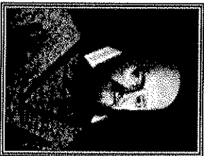
St. Francis de Sales