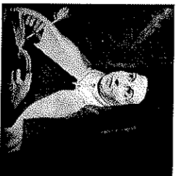
St. Teresa of Avila