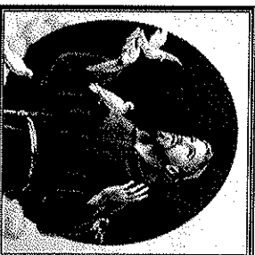
St. Francis of Assisi