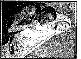
Sts. Augustine, Monica