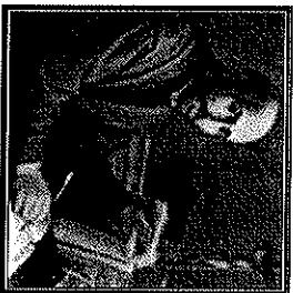
St. Ignatius of Loyola