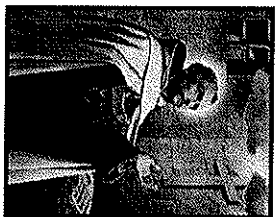
St. John of the Cross